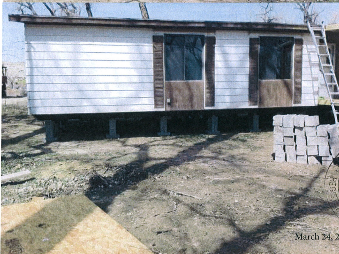
March 24, 2015 South