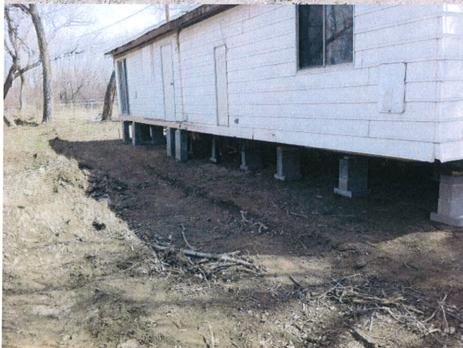
March 24, 2015 North