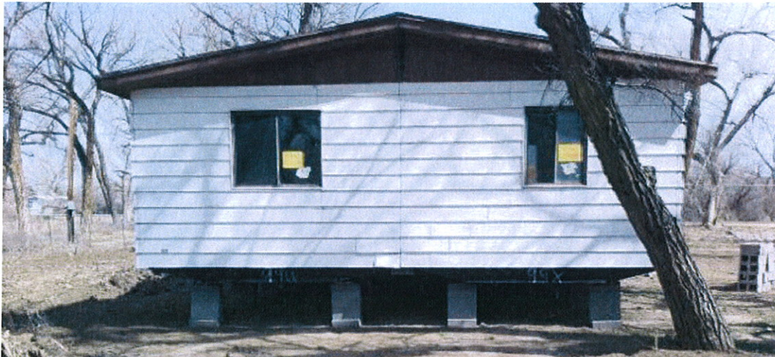
March 24, 2015 West

If submitting more photographs than will fit on the preceding page, affix the additional photographs below. Identify all photographs with: date taken; "Front View" and "Rear View"; and, if required, "Right Side View" and "Left Side View." When applicable, photographs must show the foundation with representative examples of the flood openings or vents, as indicated in Section A8.