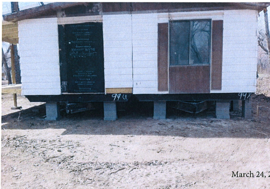
March 24, 2015 East

If using the Elevation Certificate to obtain NFIP flood insurance, affix at least 2 building photographs below according to the instructions for Item A6. Identify all photographs with date taken; "Front View" and "Rear View"; and, if required, "Right Side View" and "Left Side View." When applicable, photographs must show the foundation with representative examples of the flood openings or vents, as indicated in Section A8. If submitting more photographs than will fit on this page, use the Continuation Page.