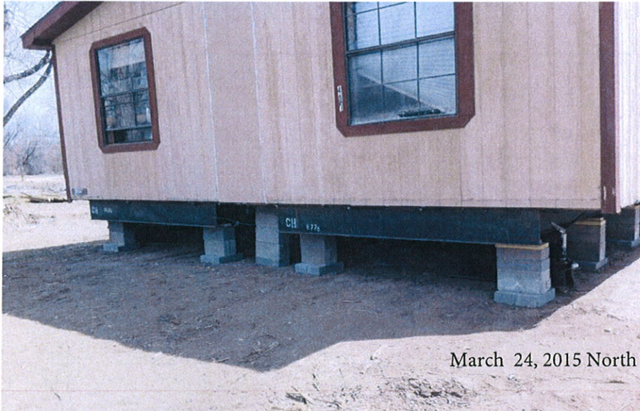
March 24, 2015 North

If submitting more photographs than will fit on the preceding page, affix the additional photographs below. Identify all photographs with: date taken; "Front View" and "Rear View"; and, if required, "Right Side View" and "Left Side View." When applicable, photographs must show the foundation with representative examples of the flood openings or vents, as indicated in Section A8.