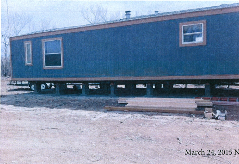
March 24, 2015 North

If using the Elevation Certificate to obtain NFIP flood insurance, affix at least 2 building photographs below according to the instructions for Item A6. Identify all photographs with date taken; "Front View" and "Rear View"; and, if required, "Right Side View" and "Left Side View." When applicable, photographs must show the foundation with representative examples of the flood openings or vents, as indicated in Section A8. If submitting more photographs than will fit on this page, use the Continuation Page.