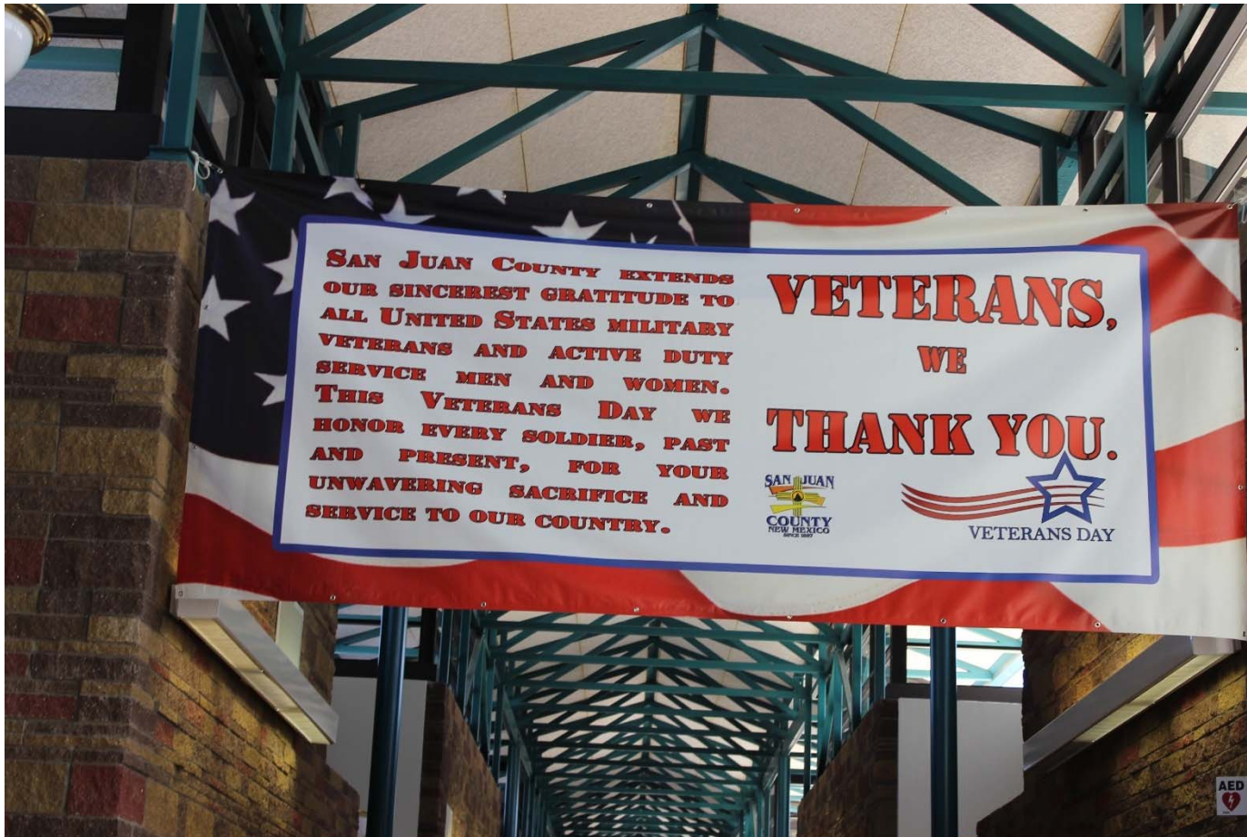
Veteran's Day – Administration Building