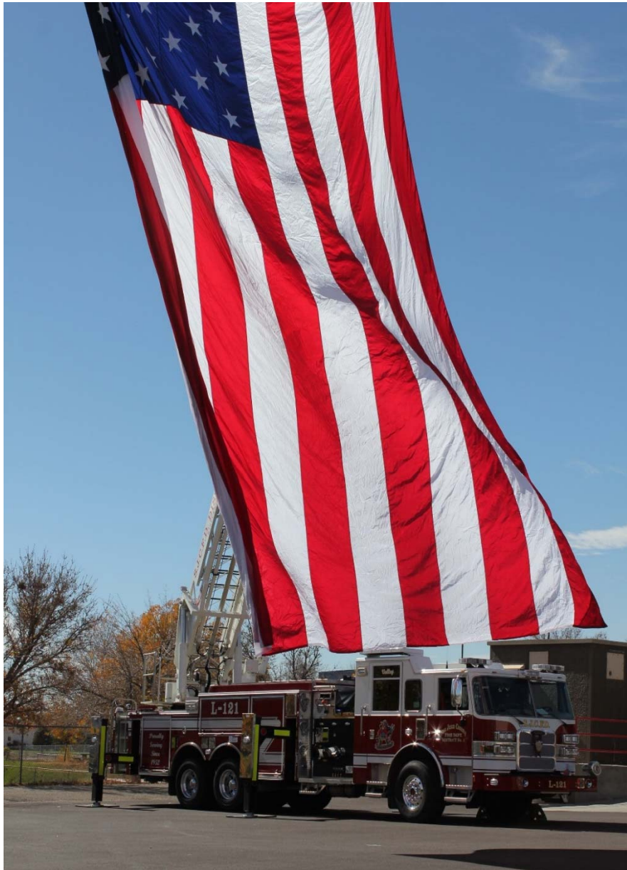
San Juan County Fire L-121