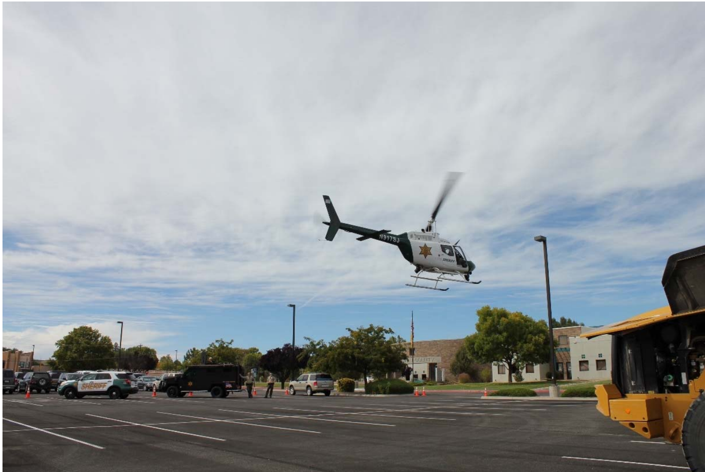
National County Government Day