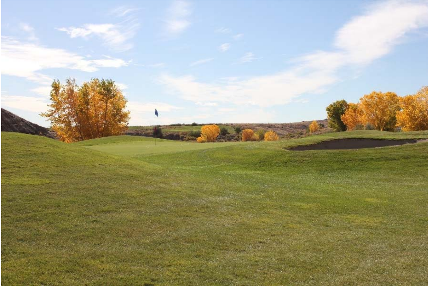
Riverview Golf Course