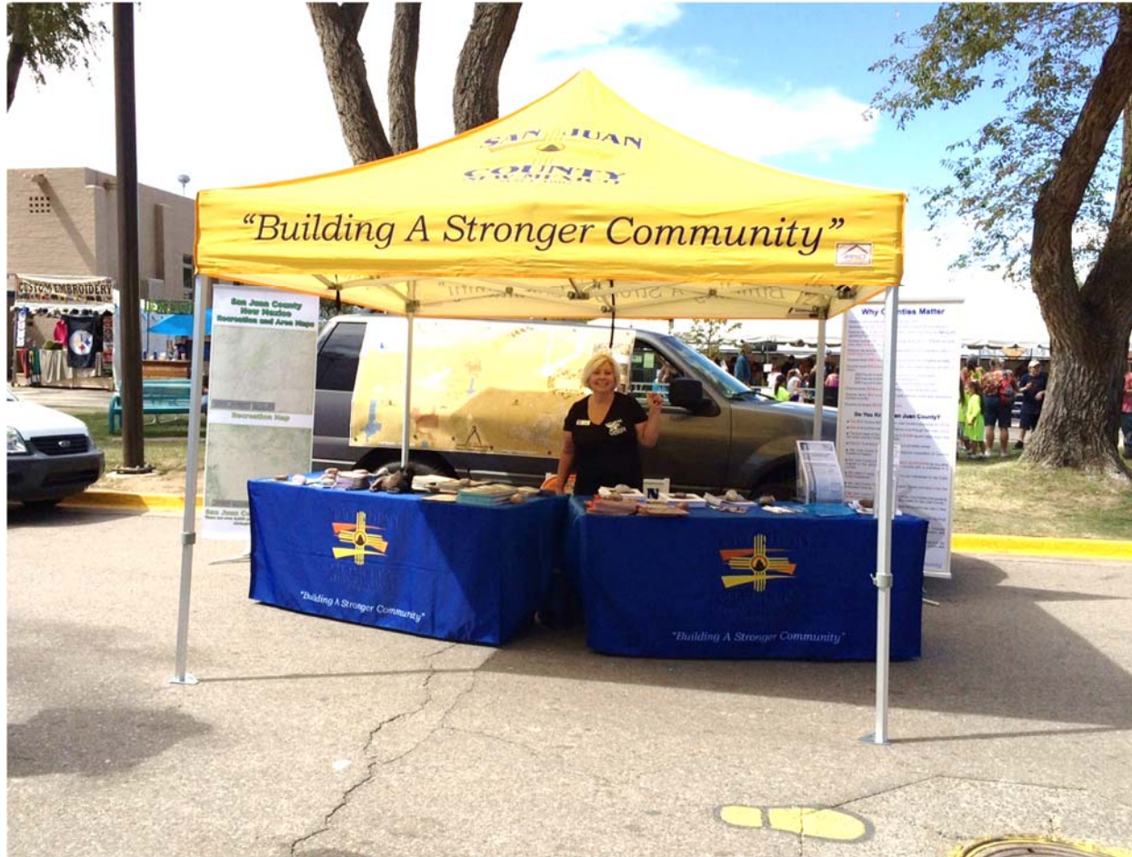
New Mexico State Fair Booth