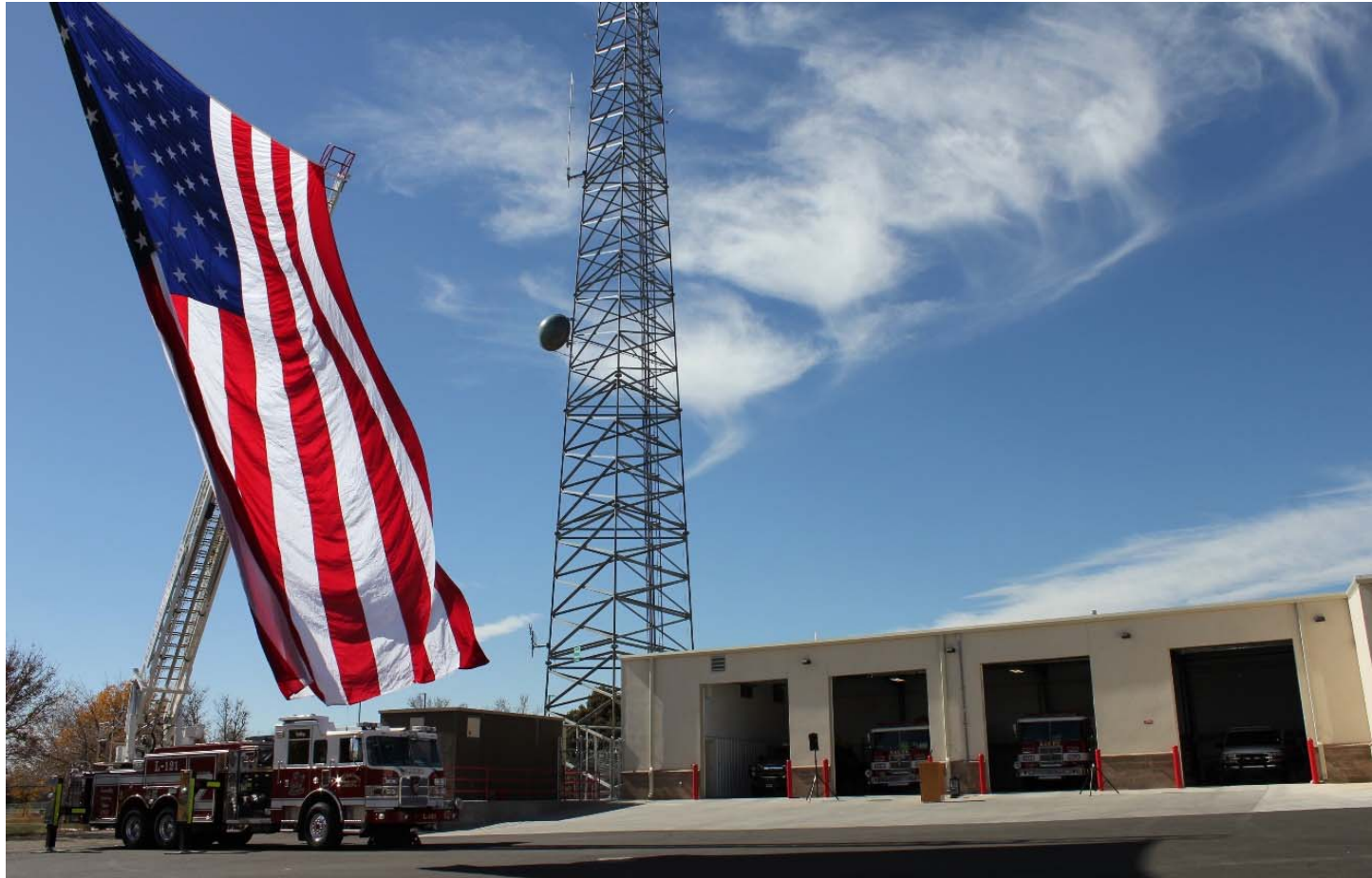
Valley Fire Station #1