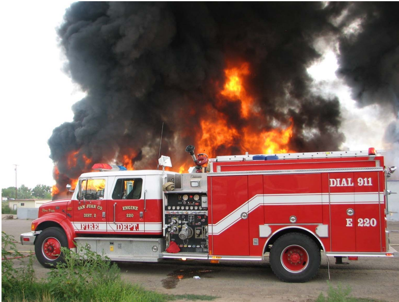
San Juan County Fire Engine 220