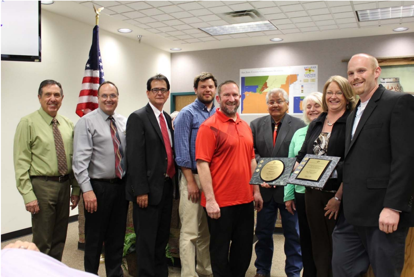
2015 GFOA Certificate of Achievement for Excellence in Financial Reporting & Distinguished Budget Presentation Award