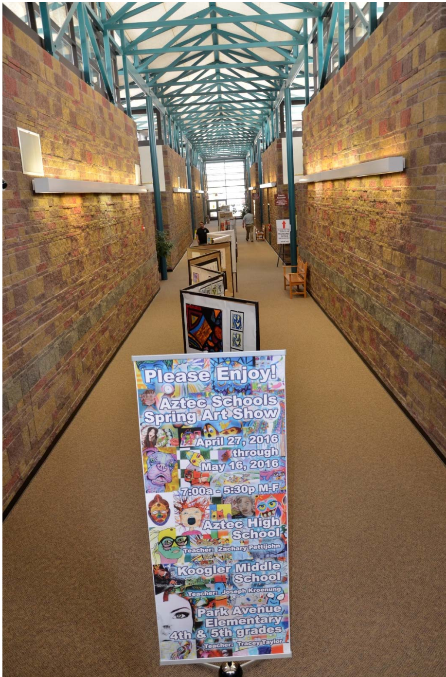
Aztec Schools Art Show – Administration Building