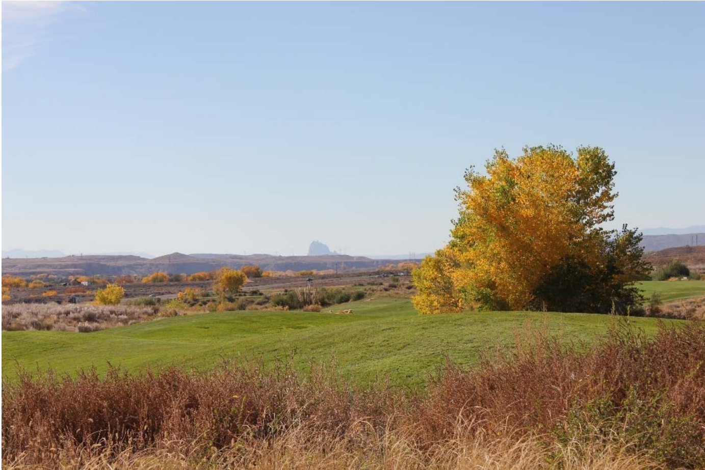
Riverview Golf Course View of Shiprock