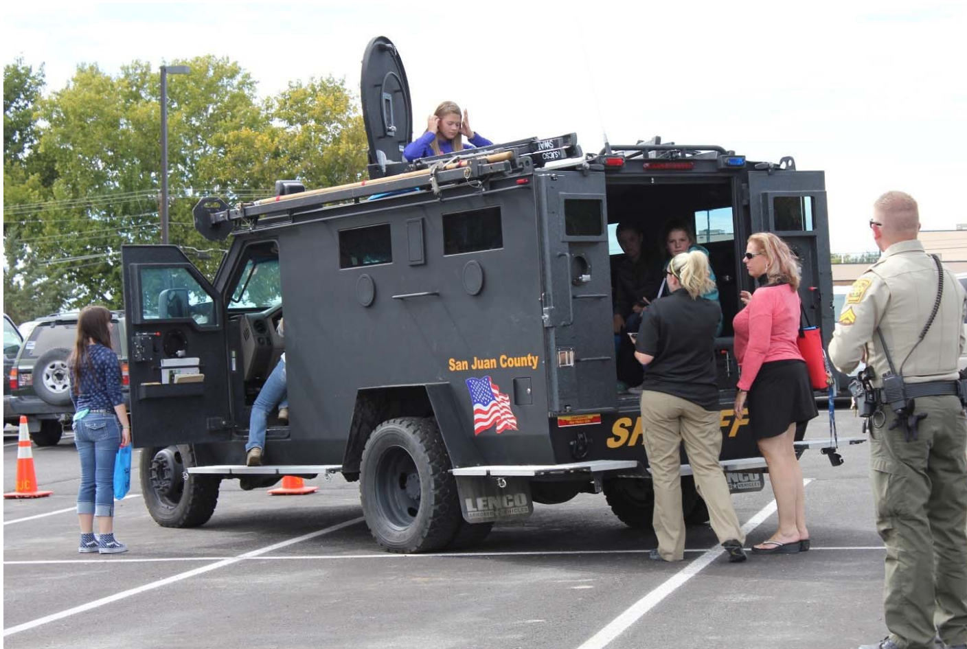
National County Government Day